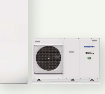
Heat Recovery Ventilation + DHW Square Tank + Aquarea Monobloc