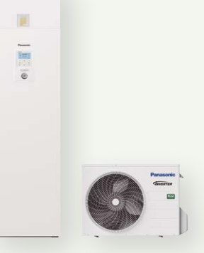
Heat Recovery Ventilation + Aquarea All in One Compact

Combine the Residential ventilation unit with Panasonic Aquarea for an space saving and highly efficient solution for heating, cooling, ventilation and DHW.