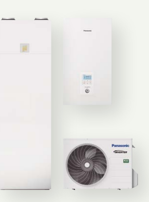
Heat Recovery Ventilation + DHW Square Tank + Aquarea Bi-bloc